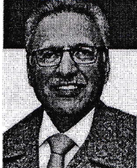
President Alvi praises projects of Aah-e-Pak Authority