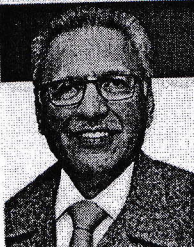
President Alvi praises projects of Aab-e-Pak Authority