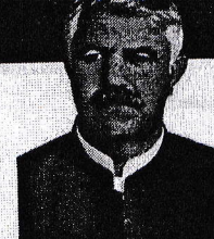
Higher educational institutions facing setup in all KP districts: Mahmood

Founded by: ZAHID MALIK (Sikera-I-Insar)