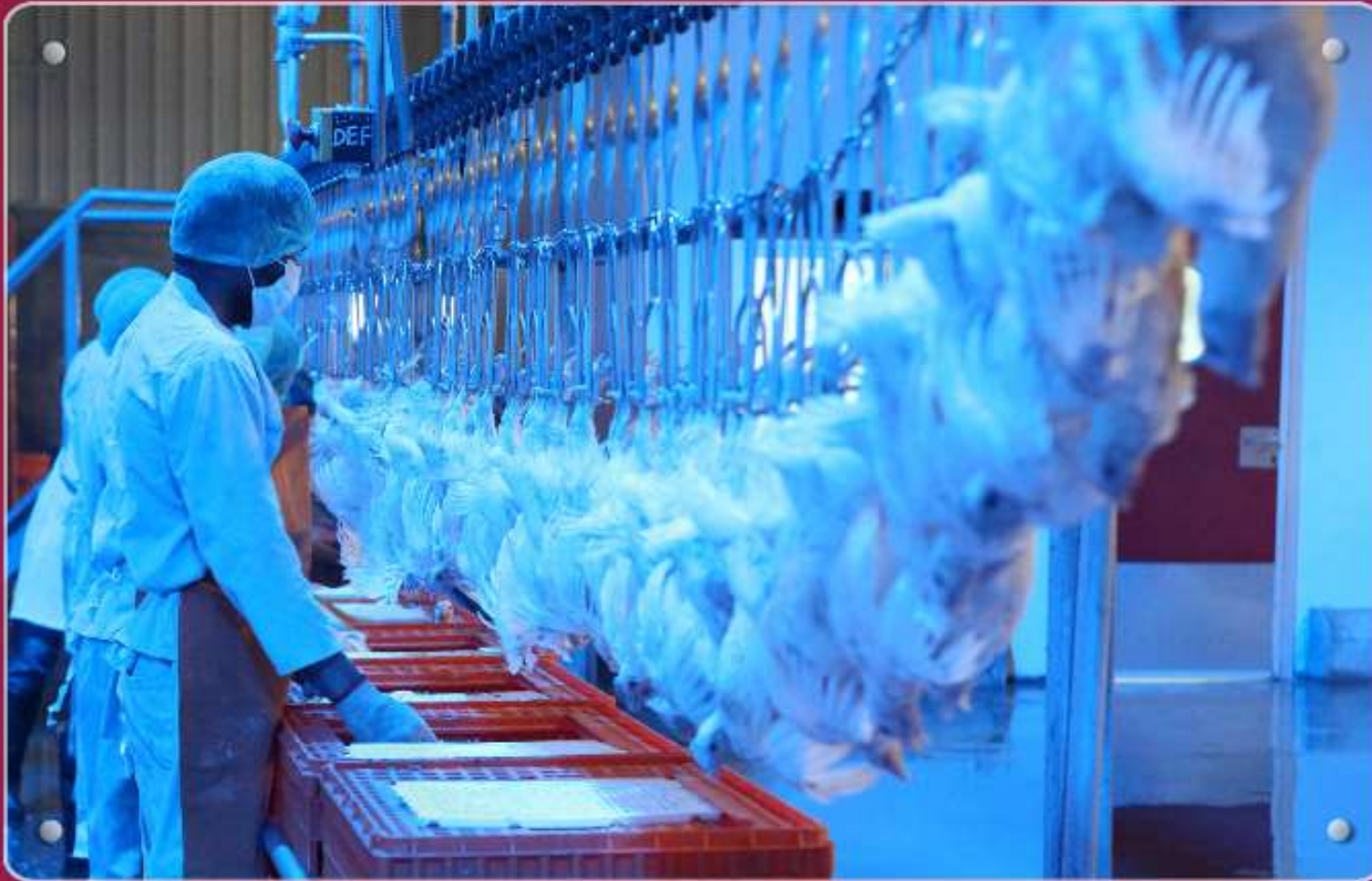
Hanging of Birds