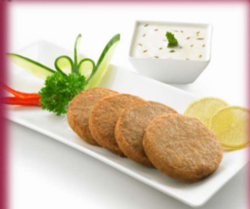
Chicken Shami Kabab