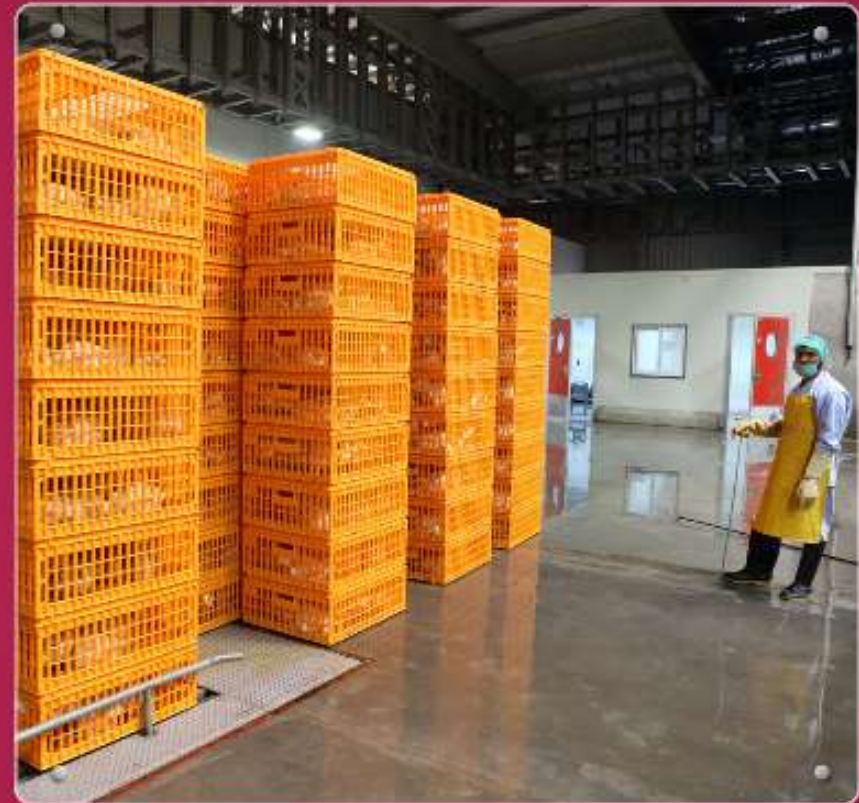
Receiving of Chicken