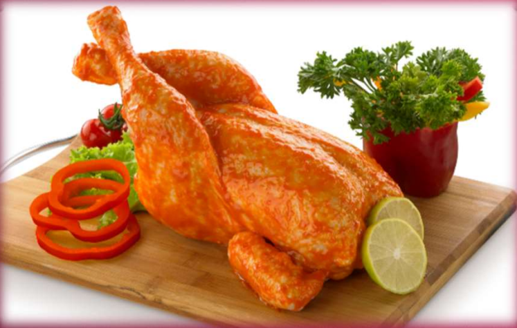
Marinated Whole Chicken