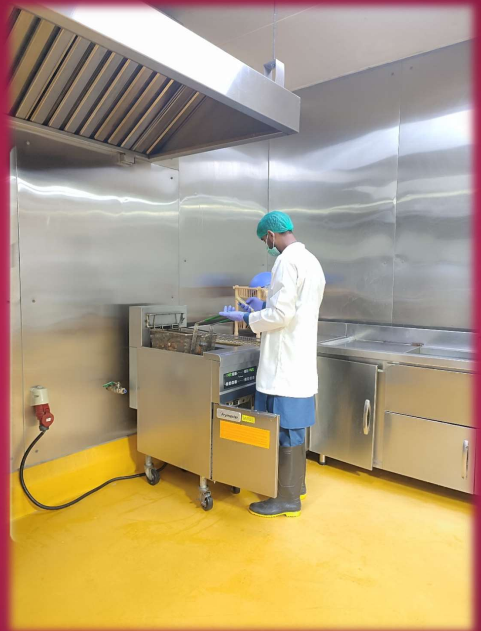
Miniature Equipment lab