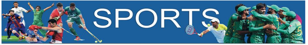
Friday November 08, 2024