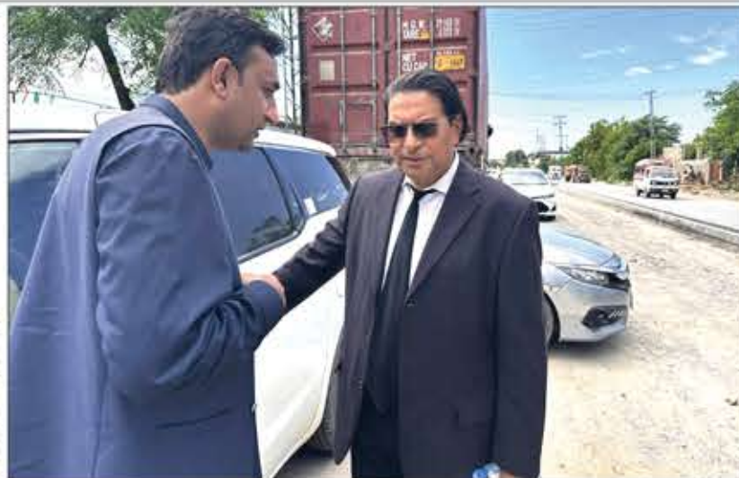
RAWALPINDI: PTI Secretary General Salman Akram Raja arrives at Adiala Jail to meet party founder Imran Khan, here on Tuesday.