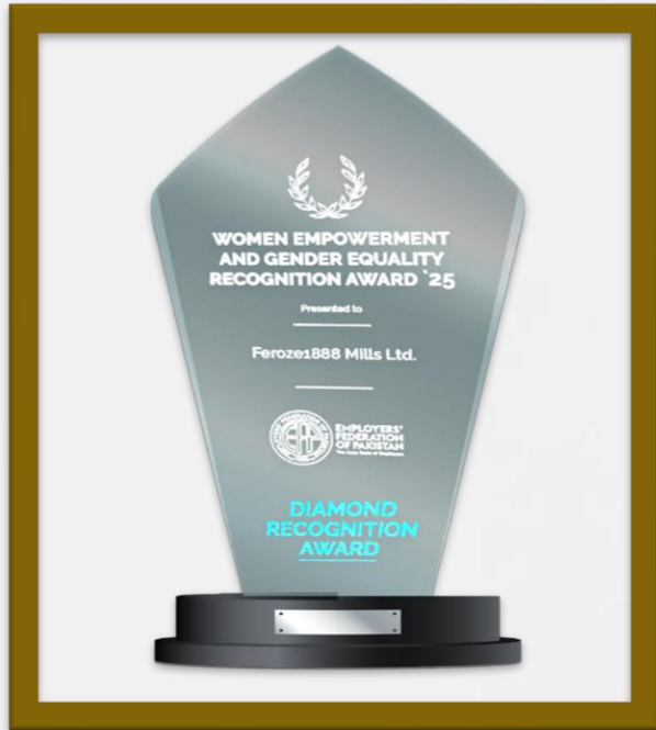
“Women Empowerment & Gender Equality Recognition Award 2025”