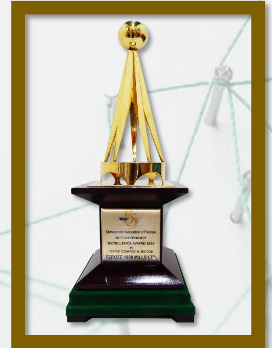
“Annual Environmental Excellence Award 2024”