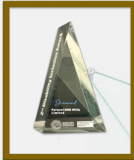
“Disability Inclusion Excellence Award 2024”