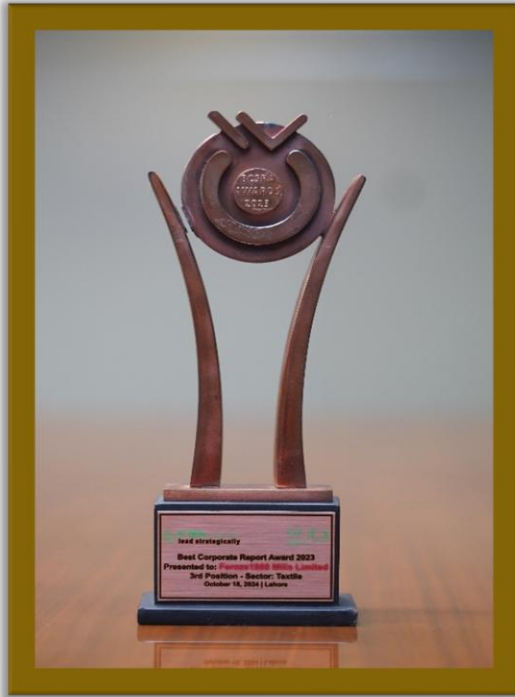
“Best Corporate & Sustainability Report 2023” by ICAP & ICMAP