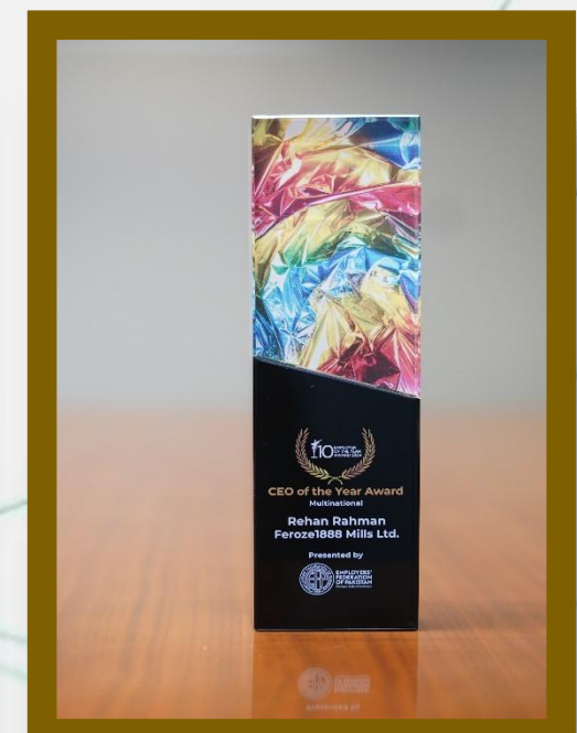
“Top CEO of the year (Multinational) 2024”