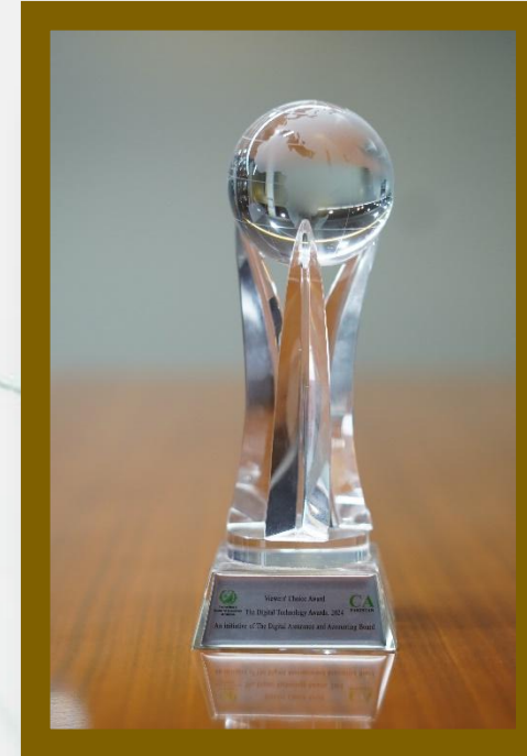
“Best Dashboard Award 2024”