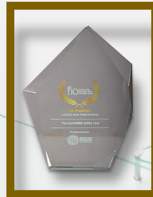
“Employer of the Year Award 2024”