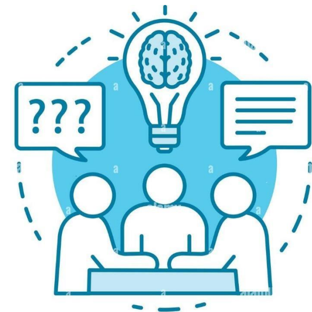
Board of directors