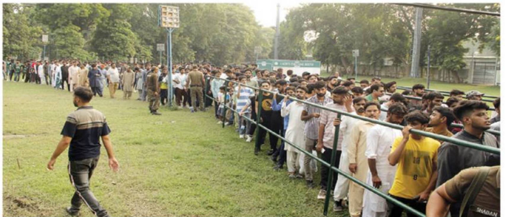
LAHORE: People line up to enter Gaddafi Stadium ahead of fifth T20I match between Pakistan and England.