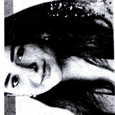
Tere Bin OST, episodes removed from YouTube amidst copyright claims