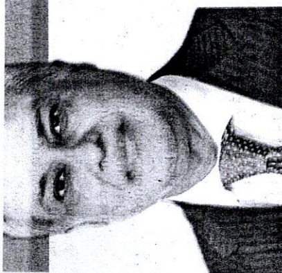
Pakistan attaches great importance to its relations with Indonesia: Dar