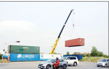
Capital authorities removing containers placed in the city to block roads for security of anti-government protesters.

He said the CJP was fully aware of the corruption in Al-Qadir Trust case. The amount in Al-Qadir Trust was to be deposited in the Supreme Court, he added. Has any judge ever said welcome and good luck to the accused, the minister questioned? However, he said 450 kanals of land was purchase in Jhelum in lieu of the said amount.