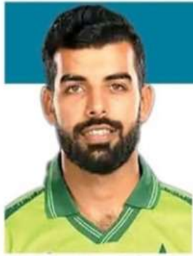
Babar, Shadab on ICC Men's Player of the Month shortlist