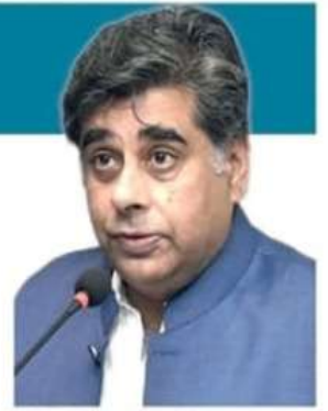
US-Pakistan discuss to strengthen bilateral trade, economic ties