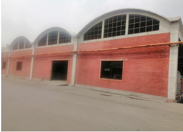
MC Tube Building