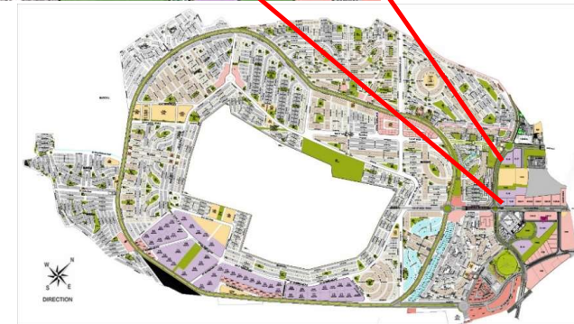
NAYA NAZIMABAD Master Plan