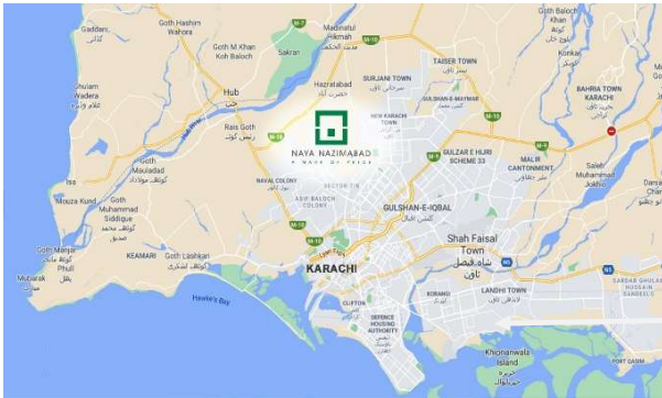
KARACHI MAP NN Location