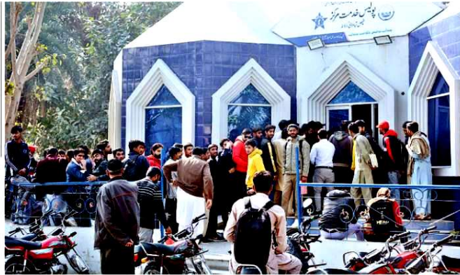
Faisalabad: A large number of people standing in queue outside Police Service Centre to get their driving licence at D-Ground.