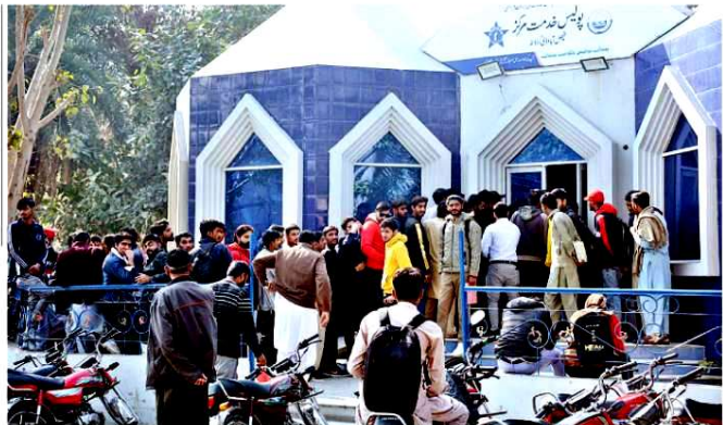
Faisalabad: A large number of people standing in queue outside Police Service Centre to get their driving licence at D-Ground.