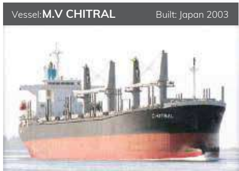
Deadweight (MT): 46,710 Length Overall (M): 185.73 Gross Tonnage (MT): 26,395