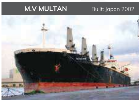
Deadweight (MT): 50,244 Length Overall (M): 189.80 Gross Tonnage (MT): 27,984