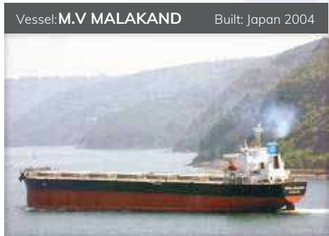
Deadweight (MT): 76,830 Length Overall (M): 225.00 Gross Tonnage (MT): 40,040