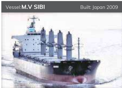
Deadweight (MT): 28,442 Length Overall (M): 169.37 Gross Tonnage (MT): 17,018