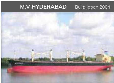
Deadweight (MT): 52,951 Length Overall (M): 188.50 Gross Tonnage (MT): 29,365